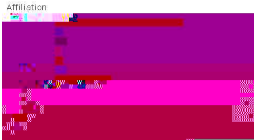
Figure 3 Affiliation of Complainants and Respondents

Disclosures don't require a complainant to divulge the particulars of their case, therefore the total number of respondents identified can remain reduced.